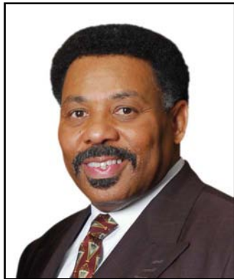
Tony Evans Conference Host Senior Pastor Oak Cliff Bible Fellowship Church Dallas, TX